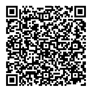
Scan the QR code to listen to the podcast episode